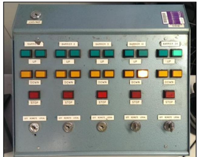
Figure 1: A typical VACP including active VSBs (left); control panel for an active VSB (right)